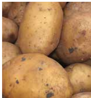
NITROPHOSKA® EXTRA - 65% WATER SOLUBLE FOR IMMEDIATE UPTAKE