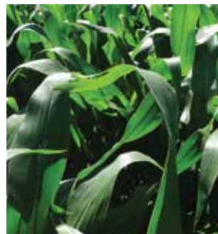
NITROPHOSKA® SELECT - 75% WATER SOLUBLE PHOSPHATE FOR EARLY ROOT GROWTH