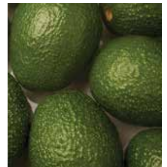
ENTEC® SPECIAL - ALL POTASH IS IN THE PREMIUM POTASSIUM SULPHATE FORM