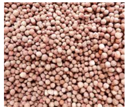
NITROPHOSKA® SELECT - STARTER FERTILISER FOR MAIZE, CEREALS AND FODDER CROPS

Reference: "Managing Soil Fertility on Cropping Farms" (2000) NZFMRA and NZPARI. High: >4 previous years in pasture or Avail N >180kg/Ha. Med: 1-3 previous years in pasture or Avail N 75-180kg/Ha. Low: >4 previous years in depletive crop or Avail N <75kg/Ha